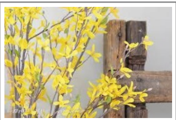
Don't worry – we'll be seeing Spring's colors very soon!