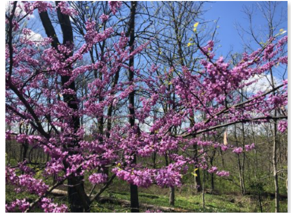
1/2 Million Native Trees and Woody Shrubs!

In 2020 we asked people to write to tell us about the number of native trees and woody shrubs they planted in Ohio, with a goal of 100,000. With COVID cancelling all activities in April (Native Plant Month), we did not expect to meet our goal. But by the end of the year, it was reported that 195,152 native plantings (almost 200,000) have been planted. So in 2021, GCA set a goal of 200,000. And by the end of the year we had recorded the planting of OVER 300,000 (331,392)! Over the past two years people reported over 1/2 MILLION native trees and shrubs! And I'm sure there were lots we never learned about!